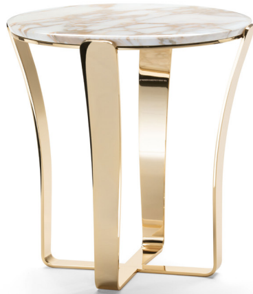
fin. MOB | Marble top CA - Gold Calacatta

“Una forma essenziale, resa preziosa dai contrasti materiali ricercati che esaltano i profili eleganti. Margot è un tavolino con piano d'appoggio in marmo sorretto da una struttura metallica a pianta incrociata.”