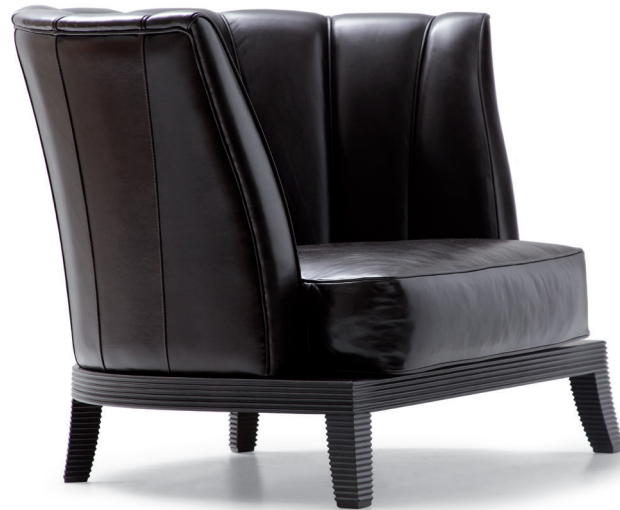
fin. EBA | PX 2402

“Una collezione di sedute evocativa e ricercata, arricchita da preziosi dettagli sartoriali che si accostano armoniosamente alla struttura in legno di faggio con decorazioni geometriche a righe.”